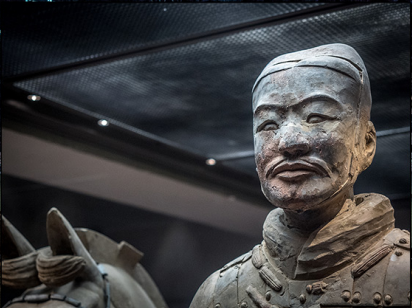
秦始皇 Qin Shi Huang's mausoleum is accompanied by over 8,000 terracotta soldiers and 600 horses